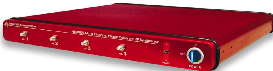
HSX9004A – 4 channel RF Synthesizer Phase Coherent, 100% Independently Tunable Channels