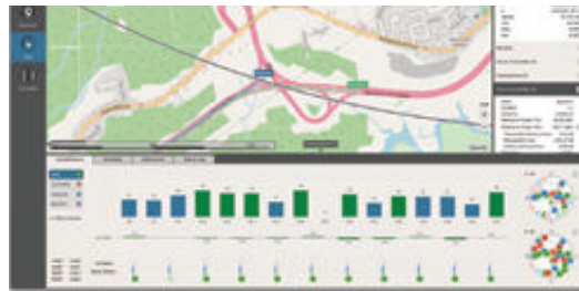
Some of its many innovations include a user-friendly interface, powerful and documented API, and intuitive automation tools.