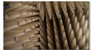
From single test benches up to complex multi-antenna test systems, multiple configurations are available to adapt to your needs.